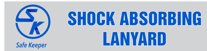
Label for Shock Pack (Front Side)

All Safe Keeper rope grabs and vertical lifelines include this instruction manual. Special order and custom product model numbers may not be listed. New model numbers will be added in the next printing of this manual. If there is any doubt as to whether this instruction manual applies to your particular product, please contact Safe Keeper.