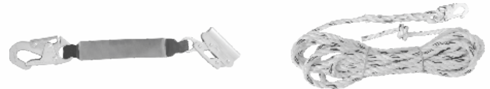
Fig. 1 - Model FAP3002-SK

Warning: NEVER attach the device on the lifeline with the arrow pointing down- ward; it will not lock onto the lifeline should a fall occur.